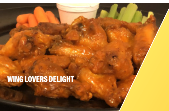
WING LOVERS DELIGHT