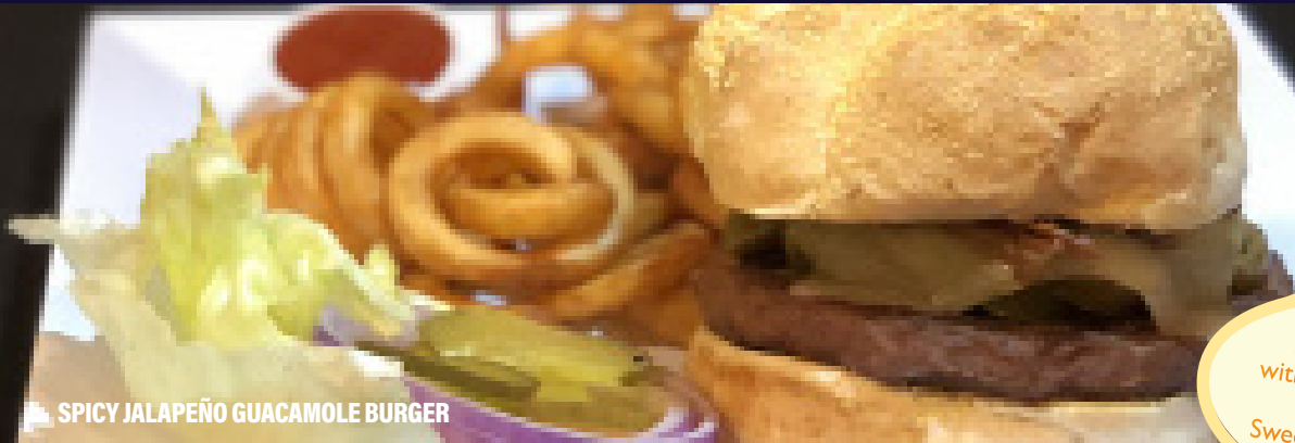
SPICY JALAPEÑO GUACAMOLE BURGER

All meals are served with Curly or French fries or substitute Sweet Potato Fries for .50